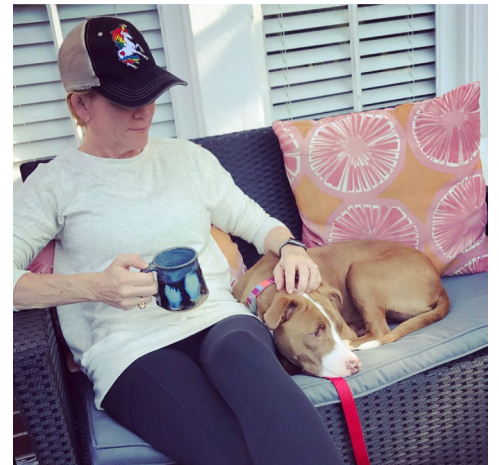
Starbuck and his Forever Family

You can make a difference for homeless animals. Visit gbhs.org today.